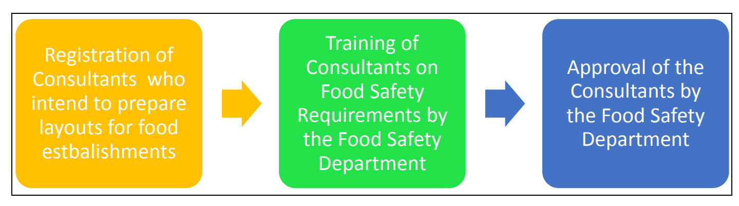
Figure 2: Process flow for registration of Consultants

Layout of food establishments should be prepared by Layout consultants (engineers/architects/food safety consultants) approved by the Food Safety Department.